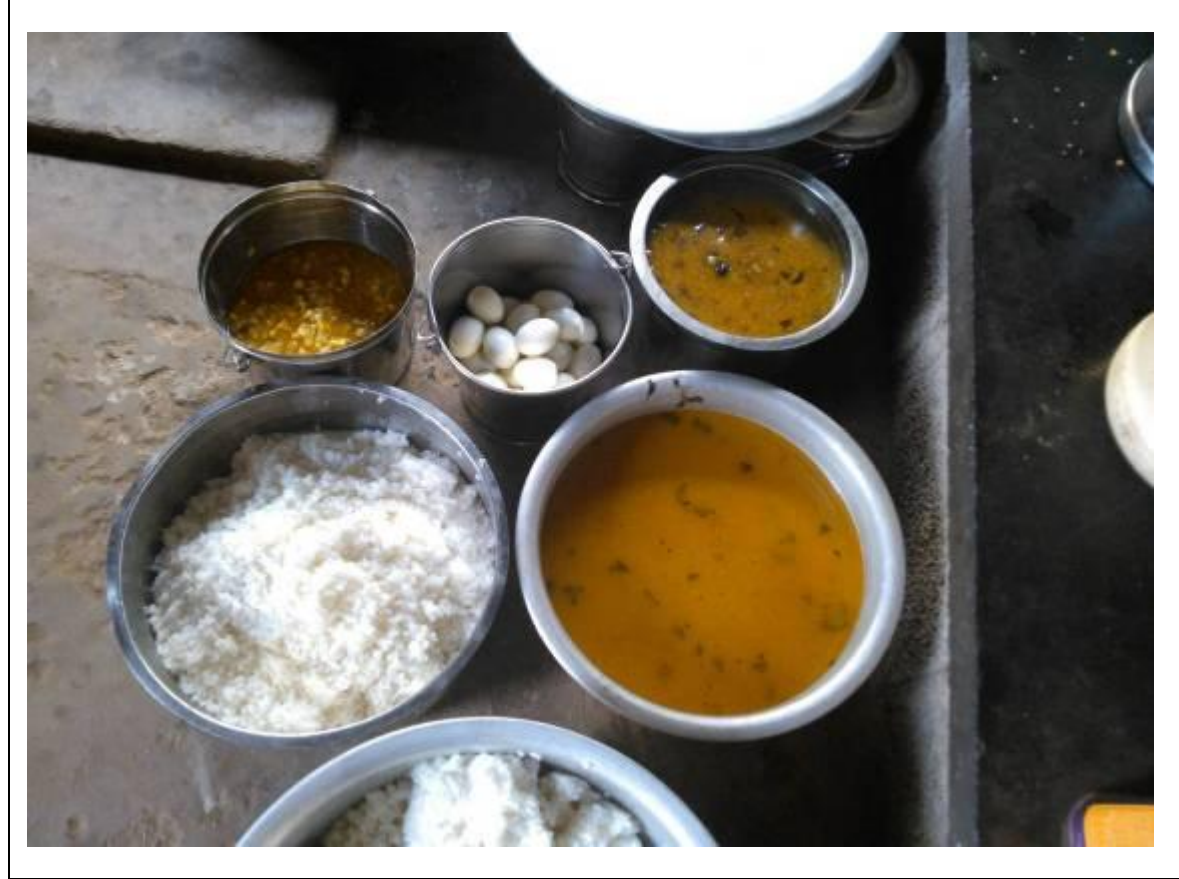
(xii) Dose the daily menu include rice / wheat preparation, dal and vegetables?

The same type of food is served daily. The only difference is in the mix up of vegetables added to the Sambar. The food has rice, dal, eggs and vegetables.