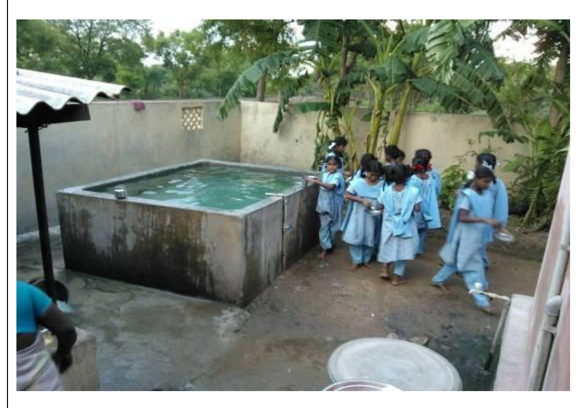
xii. Do the children par-take meals in an orderly manner?

In 6 schools (PUPS Narikuravar colony, PUPS Kannangaragudi, PUES Pisanathur, PUPS Soorakadu, PUMS Kadakkukadu and PUPS Keelapatti) the students use soap to wash their hands but there is only single soap that is being used by all the students. The SSA has provided fund to buy soaps (Rs. 100/- pm for each school) and also had given training in most of the schools on how to wash the hands. But, most of the schools implement the activities taught in the training.