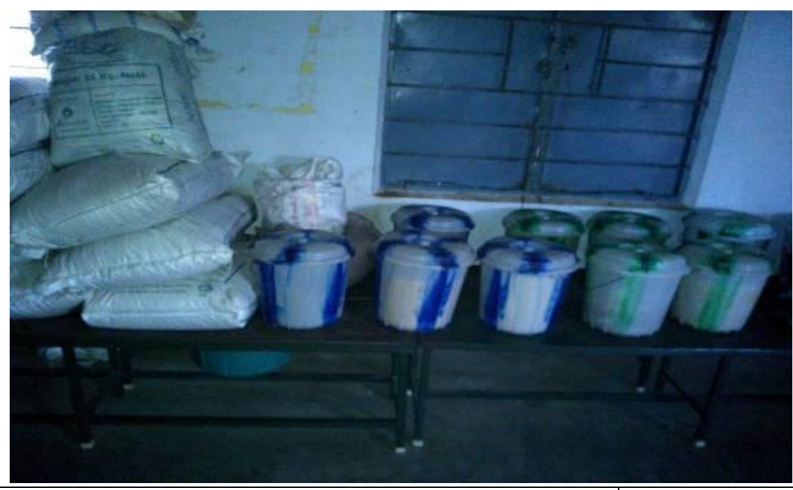
Whether potable water is available for cooking and drinking purpose?

In 24 schools the food grains are stored in the store room. In the remaining schools it is stored in the class rooms.